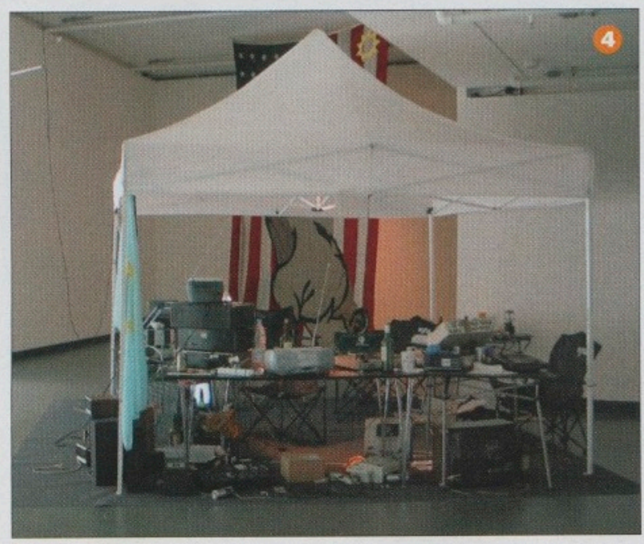
1. Dara Birnbaum's six-channel video Hostage , 1994. 2. Valerie Tevere of neuroTransmitter broadcasts radio from a black backpack in Frequency Allocations , 2005. 3. Iñigo Manglano-Ovalle's Search (En Busqueda) , 2000, turned a Mexican bullring into a radio telescope. 4. Gregory Green's WCBS Radio Caroline, The Voice of the New Free State of Caroline, 89.3 FM . 5. Siebren Versteeg's CC , 2003, which replaces news subtitles with a live stream of words from bloggers.