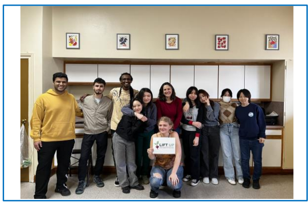
AES Class Volunteers at Lift UP Food Pantry April 2023

Lastly, I would like to thank my classmates and other students for working together very enthusiastically. I hope we all use the skills that we learned here at AES in our future studies and careers.